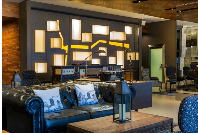
Hotel Audrey's Lobby Lounge (Please contact for hi-res images)