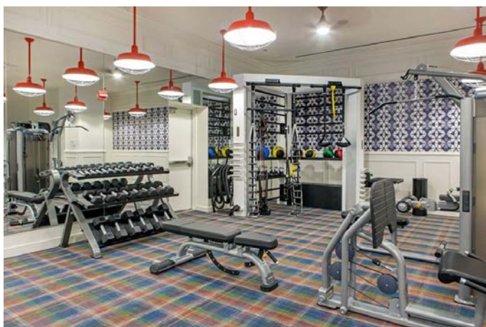
Hotel Audrey's Fitness Center (Please contact for hi-res images)

The hotel's large onsite, state-of-the-art fitness center houses a plethora of elliptical, treadmill, and other workout machines by Precor, free weights, and other equipment.