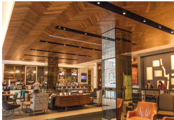
Hotel Audrey's Lobby Lounge (Please contact for hi-res images)

Oxford Hotels & Resorts, LLC an Oxford Capital Group, LLC affiliate announces official opening of the 29-story modern upscale boutique hotel