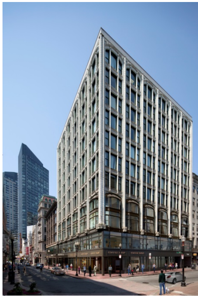
Exterior rendering of The Godfrey Hotel Boston

The expansion of the Godfrey brand honors the past while embracing the present and future